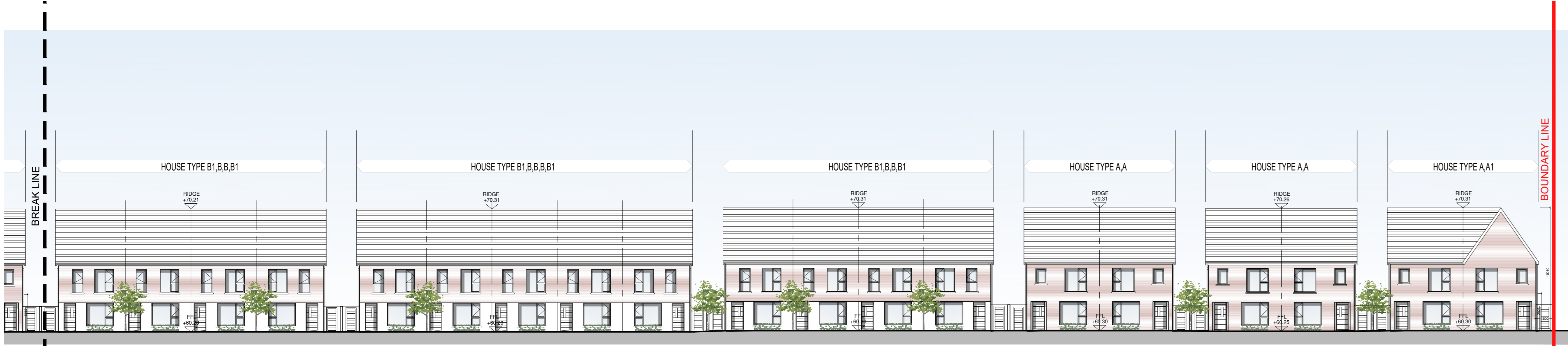
03 SECTION A - A (cont) SCALE 1:200 @ A0