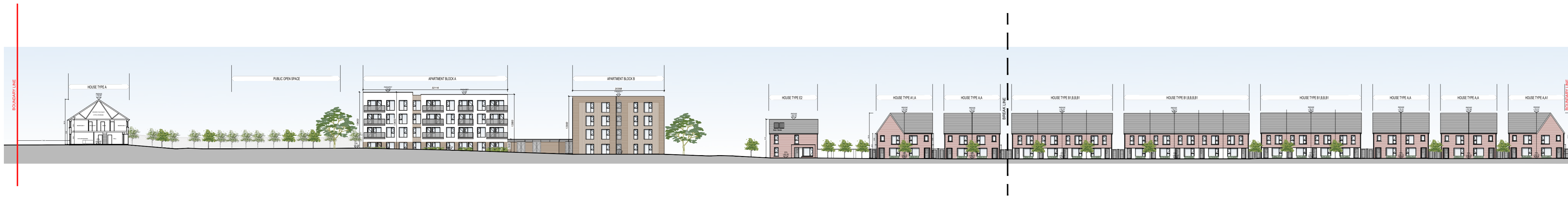
01 SECTION A - A SCALE 1:500 @ A0