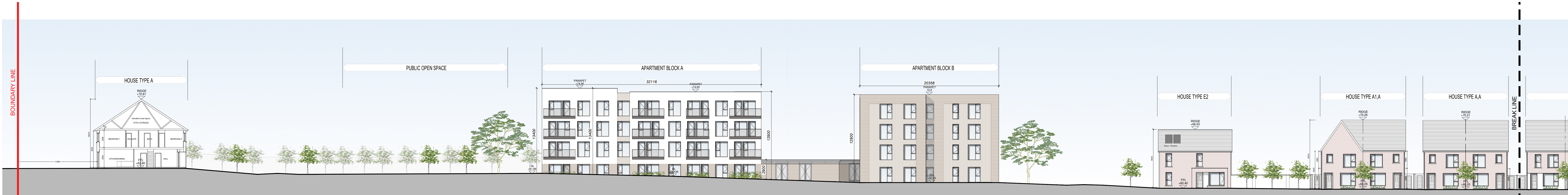
02 SECTION A - A SCALE 1:200 @ A0